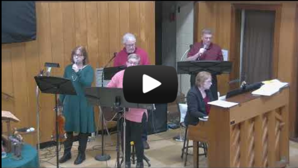
FPC FUMC Combined Choir 12-24-2022 9pm