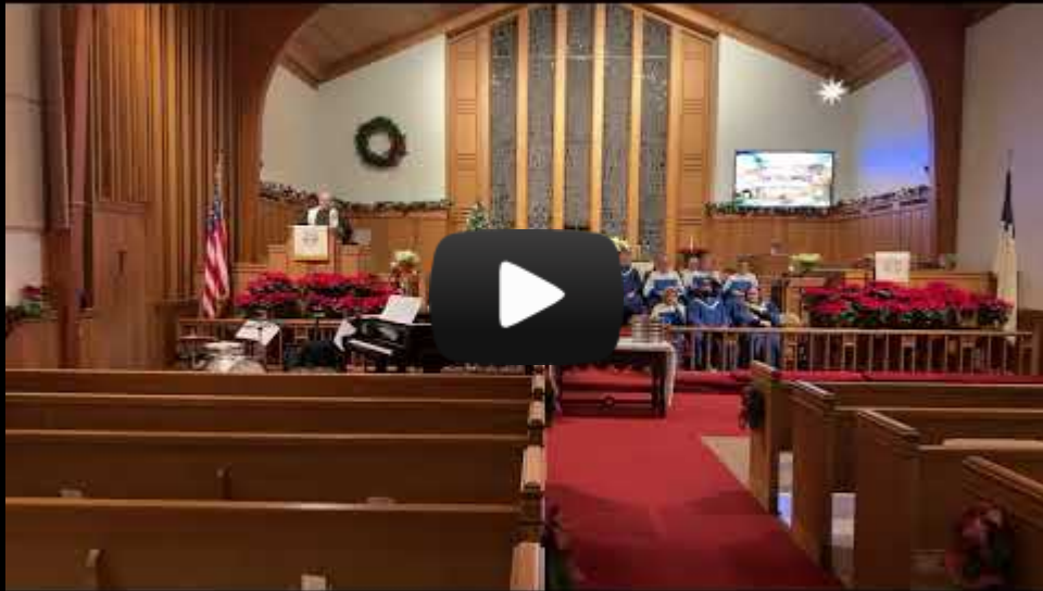
FPC Sermon 12-25-2022