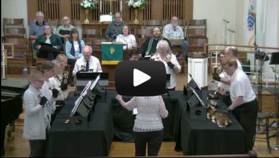
Merry Ringers Bell Choir 09-24-2023