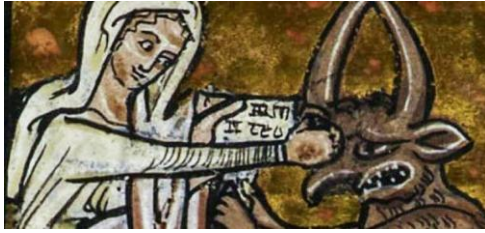
Mary punching the Devil, from a 13th century miniscule manuscript illumination