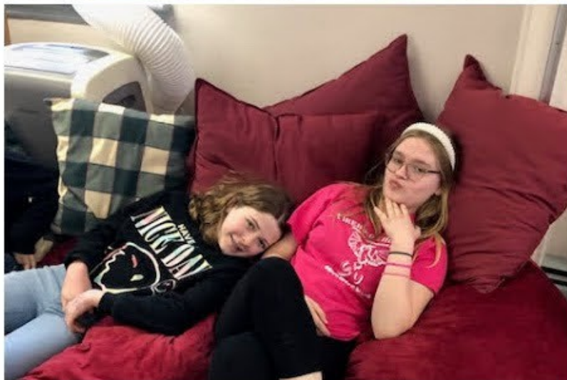
Sunday Funday for FPC's Confirmation Class!