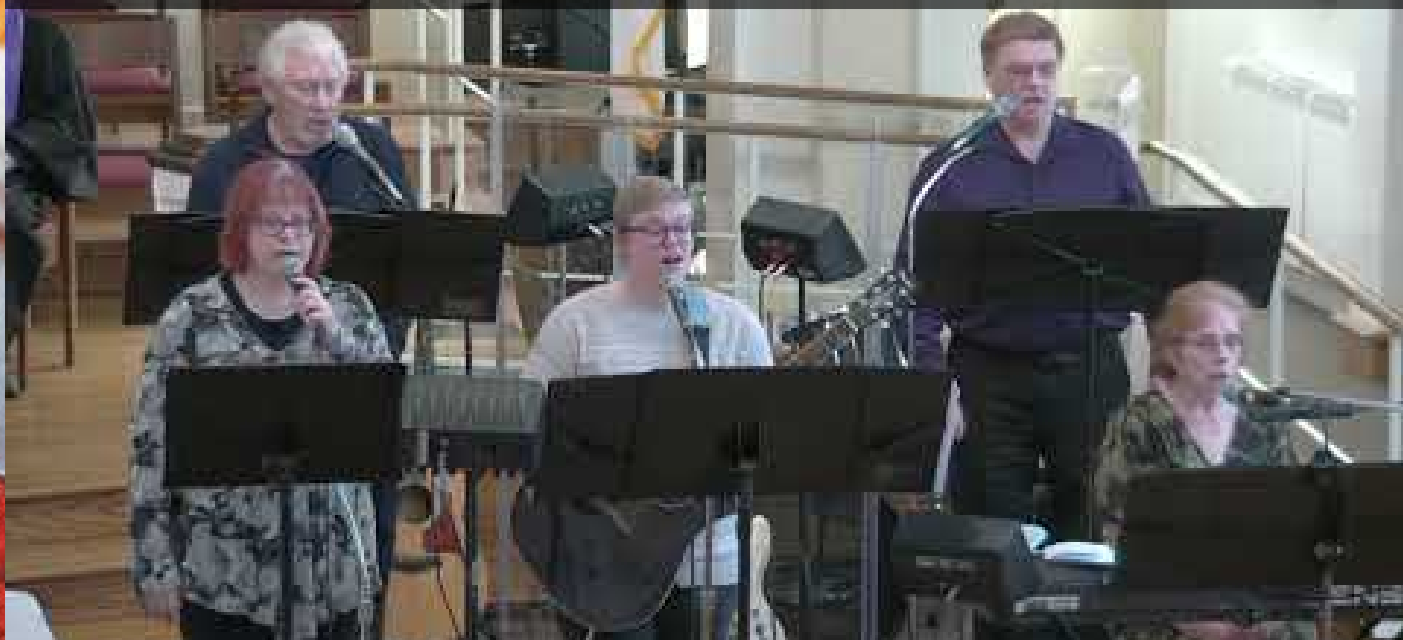
FPC Praise Team-Were You There