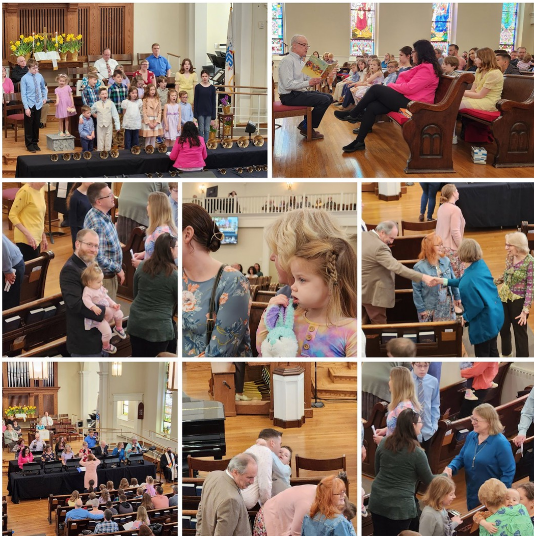
FPC Hallelujah Chorus 03-31-2024