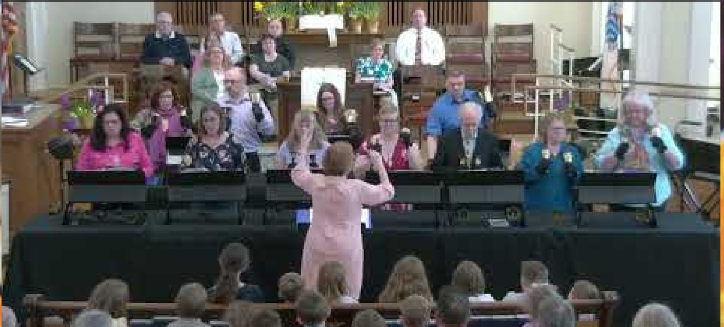
Children's Choir 03-31-2024 EASTER SUNDAY